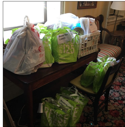
Books, computers, and supplies, plus a copier, for the schools