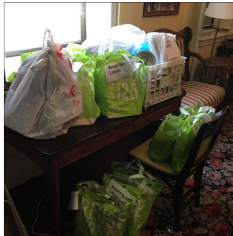
Books, computers, and supplies, plus a copier, for the schools