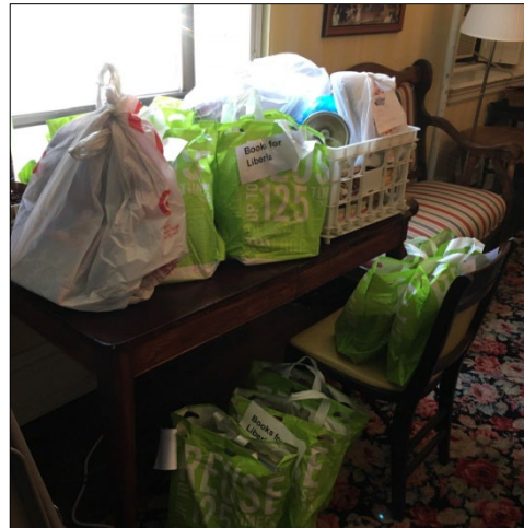
Books, computers, and supplies, plus a copier, for the schools