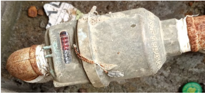
Water pipe meter